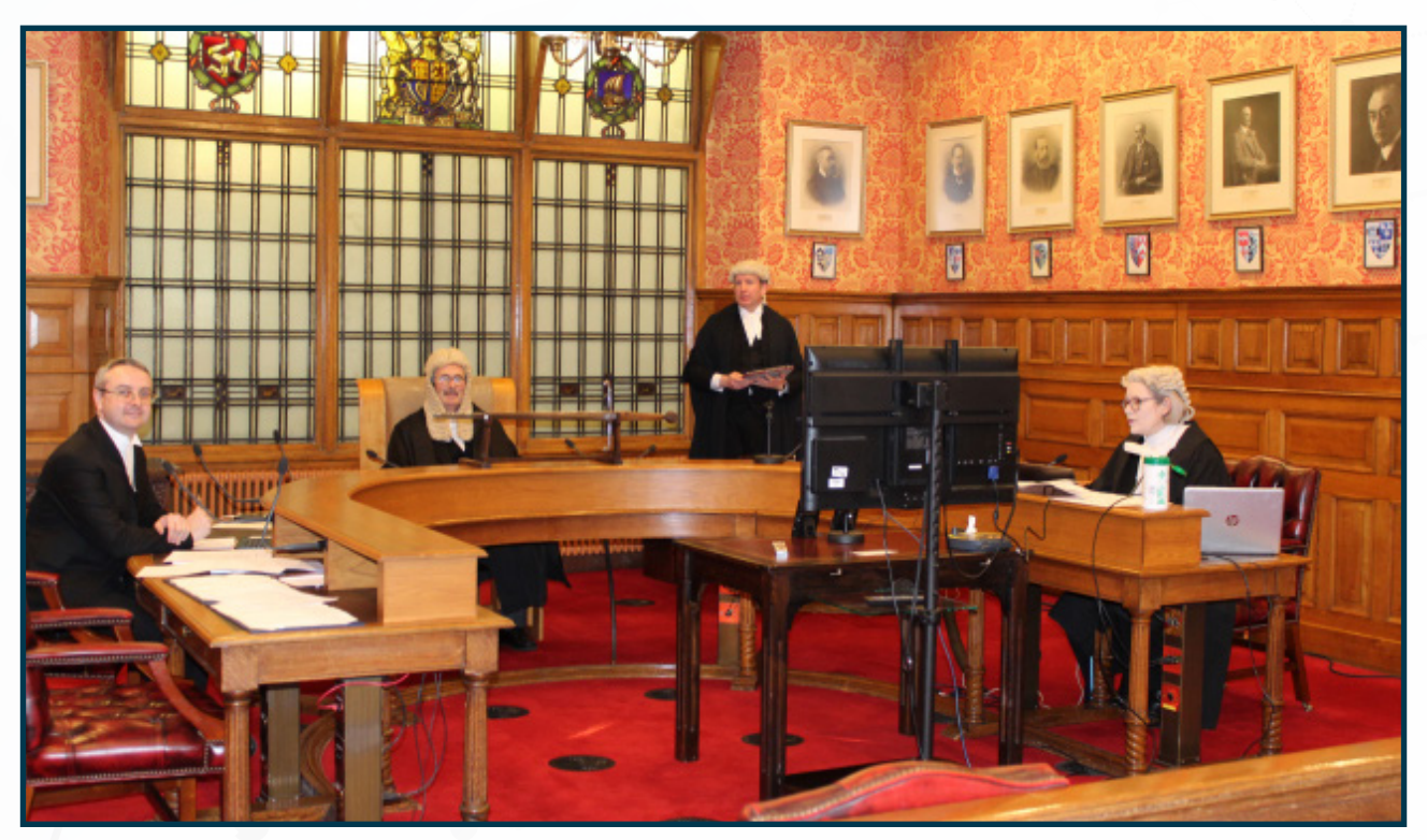
Going virtual: The Tynwald in the Isle of Man hold a plenary session virtually in response to the COVID-19 pandemic (Image courtesy of the Speaker of the House of Keys, Parliament of Tynwald).

Emergency, fast-tracked legislation can be proposed which can be passed on an expediated timetable. Such legislation is used to take decisive and rapid action in response to emergencies such as the current COVID-19 global pandemic. Emergency Legislation could take the form of delegated or secondary legislation emanating from Executive Orders or new primary legislation. The way that Emergency Legislation is enacted differs across jurisdictions - this can include the presence of a specific process for Emergency Legislation or the inclusion of measures within Standing Orders<sup>11</sup>. In the case that there is no procedure for Emergency Legislation, a Parliament often has the means to pass Emergency Legislation through its standard parliamentary channels but on a fast-tracked schedule, if there is broad agreement that this is necessary within the Parliament (and with the agreement of the Speaker).